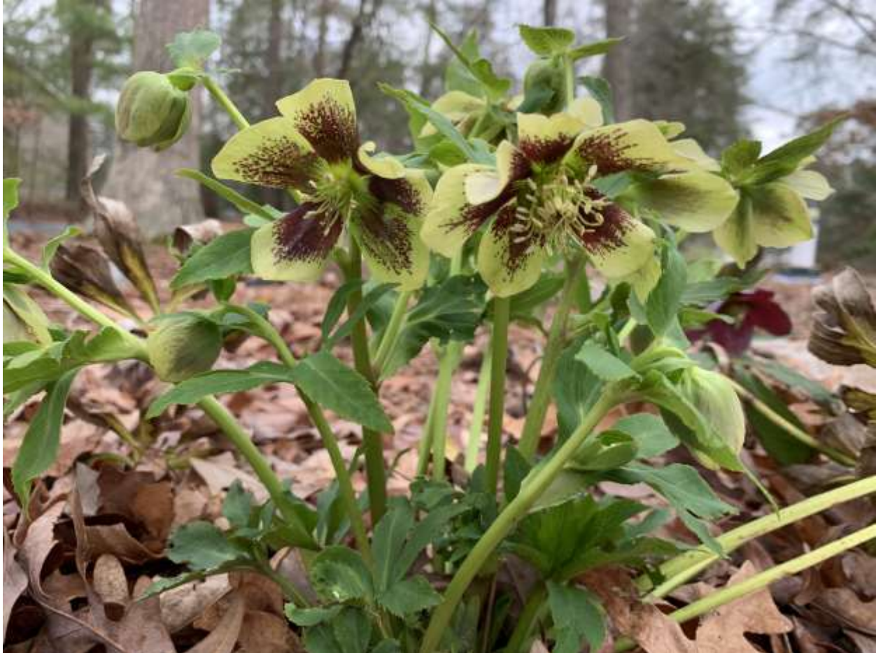
Lenten rose blooming in our yard