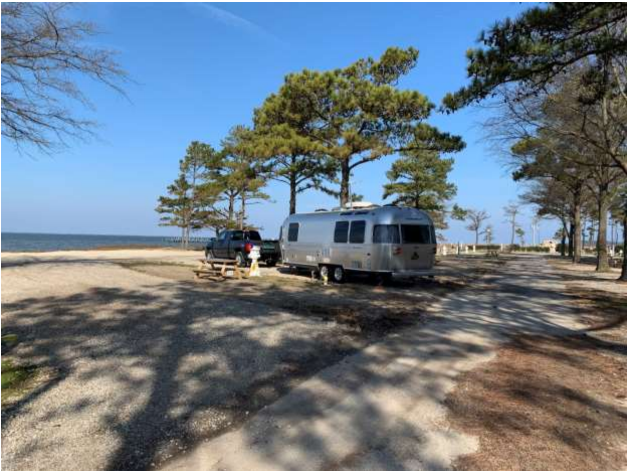
Dowells' campsite at Cherrystone late winter 2019.

At Cherrystone you'll find over 300 acres of natural waterfront on the Chesapeake Bay with over 700 sites, many shaded by tall trees. Our many features include camping cabins, on-site camper rentals, five swimming pools, four fishing piers, beautiful beach, large dog park and their very own dog beach, newly renovated Cafe/Lounge, a well-stocked General Store and the Bait and Tackle Shop. Our waterfront location will delight you with breathtaking sunsets, wildlife and a wide variety of birds. And don't forget all that there is to do! Throughout the season, we have themed weekends and plenty of planned activities for the entire family including fishing and crabbing, taking full advantage of the beautiful Chesapeake Bay!